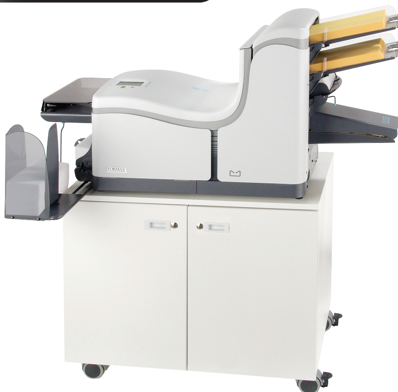
FD 6202-Advanced 2, shown with optional side exit tray and cabinet