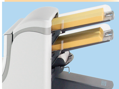
2 sheet feeders and 1 insert/BRE feeder