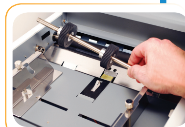
Removable Feed Wheels

Formax – New Hampshire, USA www.formax.com