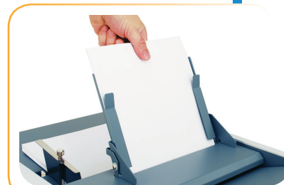
Optional Multi-Sheet Feeder