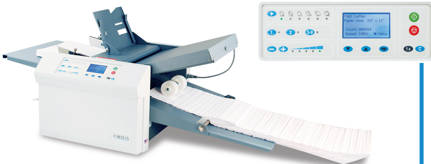
FD 382 shown with optional Multi-Sheet Feeder

The Automatic FD 382 Document Folder offers any business, church, school or print for pay center quick, easy set-up, and the versatility to complete a variety of fold jobs in minutes. Jobs are completed exceptionally fast with the FD 382, folding up to 20,100 pieces per hour! Fully automated fold plates provide one touch setup of the 18 pre-programmed fold settings or for choosing one of the 25 custom folds that can be stored into memory. In addition, the new 2.8" (71mm) backlit LCD display and control panel makes the FD 382 extremely easy to use with a step by step user interface that is second to none.