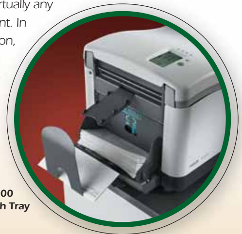
M3000 Catch Tray

The M3000 can be configured with 1 1/2, 2 or 2 1/2 stations to meet your specific needs. The document feeders can handle multiple sheets up to legal size paper. The half station is a dedicated feeder for short inserts such as business reply envelopes (BRE) and business reply cards (BRC). You also have a choice of three exits – right side, left side or catch tray – to accommodate virtually any office environment. In every configuration, the M3000 has a small footprint so it requires little desktop space.