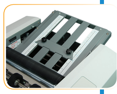
Redesigned fold plates -Clearly marked and easier to adjust