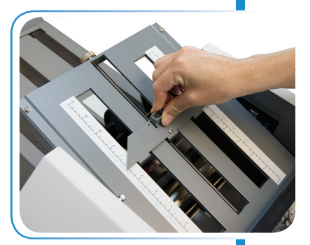
Pre-marked adjustable fold plates

** Dimensions include IL Pressure Sealer and IL Alignment Base (both included) and laser printer (not included in system)