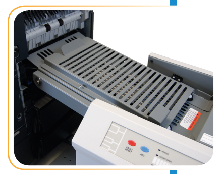
Enclosed paper path provides optimal document security

The FD 2002IL processes forms securely in a compact and powerful design. The user-friendly control panel features LED indicators and a six-digit resettable counter. The FD 2002IL is built in the USA with proven Formax strength and reliability.