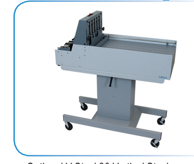
Optional V-Stack36 Vertical Stacker with adjustable-height stand