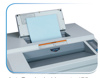
AutoFeeder holds up to 175 sheets. Load, press start and walk away!