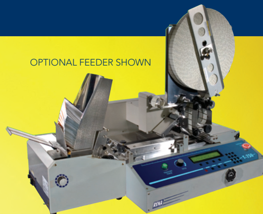
OPTIONAL FEEDER SHOWN