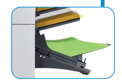
Optional Production Feeder

Formax - New Hampshire, USA www.formax.com