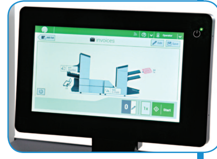
Color Touchscreen Control with Paper Presence Sensors & Graphical On-Screen Display