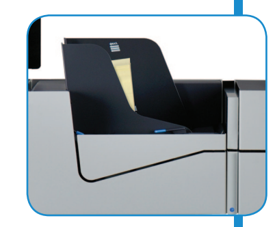
Thin Booklet Feeder