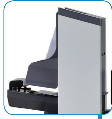
High-Capacity Vertical Output Stacker