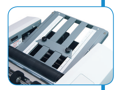
Clearly marked fold plates are easy to adjust