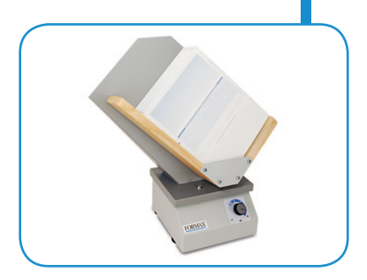
402 Series Jogger - an option which reduces static electricity from forms and aligns them for proper feeding