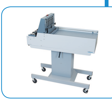
Optional V-Stack36 Vertical Stacker with adjustable-height stand

Formax - New Hampshire, USA www.formax.com Local Dealer: