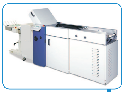
FD 2300 air-feed

** Three phase power is required. NOTE: The FD 2300-EX model requires both a 3-phase 220V outlet and a second separate 220V outlet (single phase) for the extended airfeed deck.