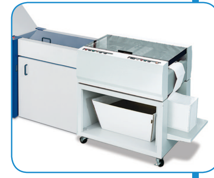
FD 2380 with in-line FD 676 Burster