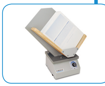
402 Series Jogger - an option which reduces static electricity from forms and aligns them for proper feeding

Formax – New Hampshire, USA www.formax.com