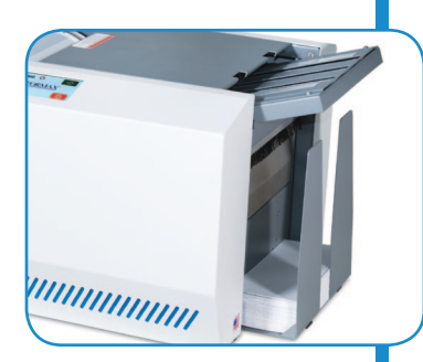
Standard Catch Tray