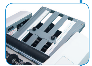
Clearly marked fold plates are easy to adjust

Touchscreen control panel is graphics-based making it easy for anyone to use